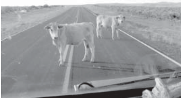
Bovine Barrier

We were, after all, packed by Friday night- a previously unheard of feat. By doing so, we avoided getting things soaked in the rain later that night, and once we had the food safely stashed Saturday morning, we fired the van up on the first try and headed to the dock before noon, all the time avoiding the concern that this was maybe too good to be true. The engine started once again after the wait in line and we cruised onto the ferry. For some reason though, this earliest ever departure for the Nevada desert wasn't to be. Upon twisting the key on the other side, all we got was the whir of the starter- no catch, no fire. They pushed us off the boat with the bull, and an hour later, inspired by