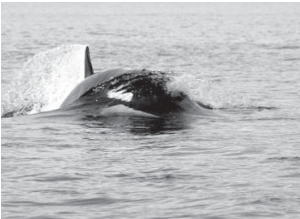
This Transient visited in February 2006, with a group that toyed for several hours with a harbor seal off the north end of Vashon.

Transient social structure is fluid; unrelated Transients regularly travel and hunt together in a "group." Researchers typically reserve the word "pod" for Resident orcas.