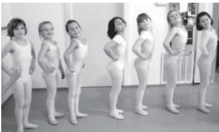
Dance, musical theatre, pottery and more are happening at Blue Heron Art Center. Sign up now!

Blue Heron Dance for all ages begins Monday, September 14. In addition to Ballet, Modern and fusion, new teacher, Dari Haffie will teach World funk for teens. The Blue Heron Dance Nutcracker will be performed at VHS Dec. 4, 5, 6. Also beginning Sept. 14, is Musical Theater for grades 1-9, with Marita Ericksen. The December performance, Ebenezer A Rock Musical includes