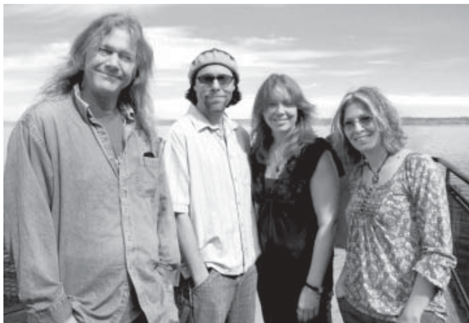
Deadwood Revival, courtesy photo.