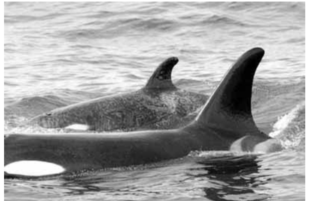
Springer (A73) with her first calf, 7/4/13.

couple of interesting notables of note on my walk around. One was a good, old fashioned porta potty that seemed in perfectly good working order. It seemed rather unphased by it's gleaming but still nonfunctional neighbor and future replacement. The other thing I saw was a lone worker at the Harbor School doing some wiring on the Community Solar project that shades the south facing windows on the school, and promises at least a partial, tangible and positive change to at least one aspect of Island Life. As I left MDP to its recovery, and walked past the bank of solar panels as I started toward home, I pondered failure versus real things that matter and wondered how that would fit into a reality show, but quickly decided it probably wouldn't get five comments on the facebook, and decided I might as well write this instead.