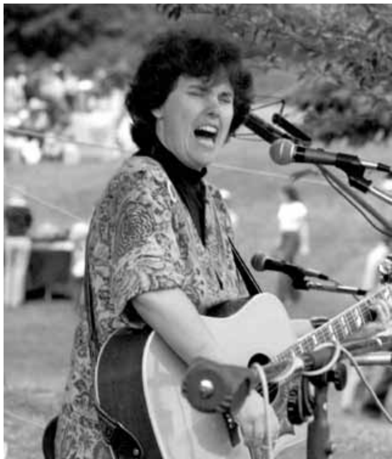
Teeth. Lots of teeth. Smart Aleck singing at 1976 or '77 Festival.