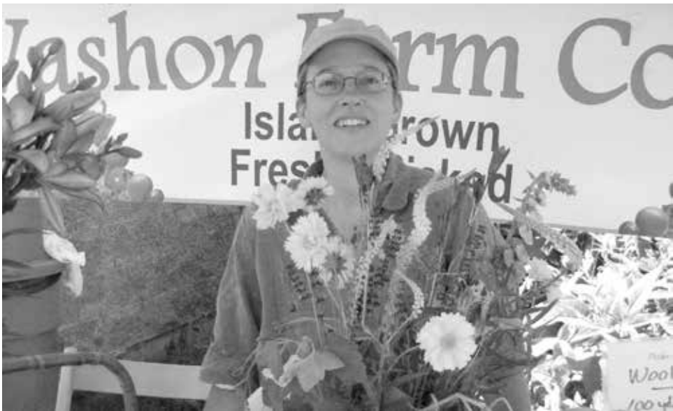
By Laurel Boyajian, L.Ac.

Island Points Community Acupuncture is open on Tuesdays 11:00-5:00 at Studio Lux, an easy uptown location between Subway and James Hair Design. In a community acupuncture clinic everyone is treated individually yet resting together in the same room. There is soothing music playing. Talking is done in whispers and is brief. You may notice a group "energy field" that becomes part of the healing atmosphere. The pricing is structured with a sliding scale so you can decide what to pay, from $20 to $40, no questions asked.